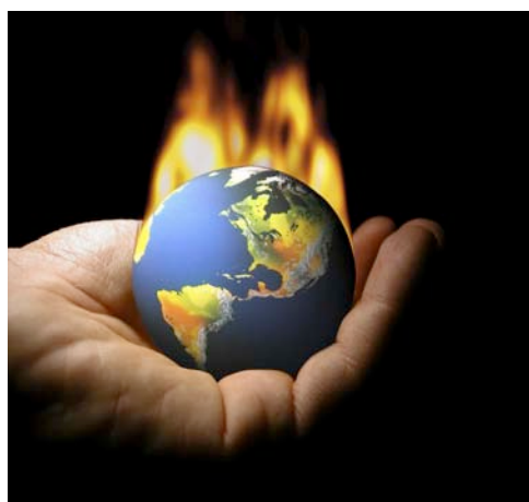
Measure of greenhouse gases in the atmosphere

on the market but we must consider that they run their systems for their own benefit. Just as we have seen in each of our global issues class reflections, they are ignorant about solving anything that does not involve maximizing their own profit. In the documentary “Tapped,” for example, we saw how the Nestle Corporation continues to pump 400,000 gallons of water a day from a community who is in drought because of them. Worse than that, the community is then paying for its own water that is now polluted by the toxic compounds that come from the petrochemical plants where plastic bottles are made. But Nestle wouldn’t stop; it was their profit that was at play. We see the same happening with global warming, degraded land, poverty, endangered species, etc.... it is money at play... and the consequences don’t seem to matter... yet.