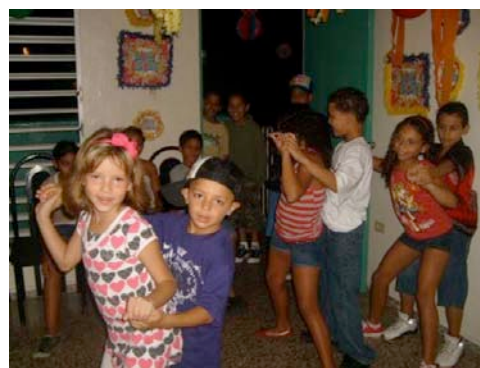
Kids Dancing Reggaeton

Obviously, the type of lyrics and dancing that often accompany Reggaeton are not often grandma-friendly. On the other hand, you exist because she at one time did the deed. Therefore, is it so terribly wrong? The government in this case I feel doesn't have the power to tell people what they can and cannot listen to. Oops, I forgot. It's Cuba. This is another way the government oppresses the population of the island. Why can't they just listen to the music they wish? Many of these songs are eye-opening and simply invigorating for many of the people living on the country.