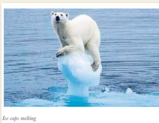
Ice caps melting

Human activity continues to harm the environment as civilizations require more and more from the earth. More and more energy will be needed. Humans searching for profit leads them to make decisions based on the short-term outcomes, but never the long-term consequences. Humanity needs to understand that there is a greater need for the environment than for money. We can live without money, but not without oxygen. If we know that humans are capable of discovering, designing, and inventing, why not do this for the benefit of all our global issues and not for the benefit of a corporation or individual. How can we call this progress when we don't use these technological advances to our benefit but to our detriment?